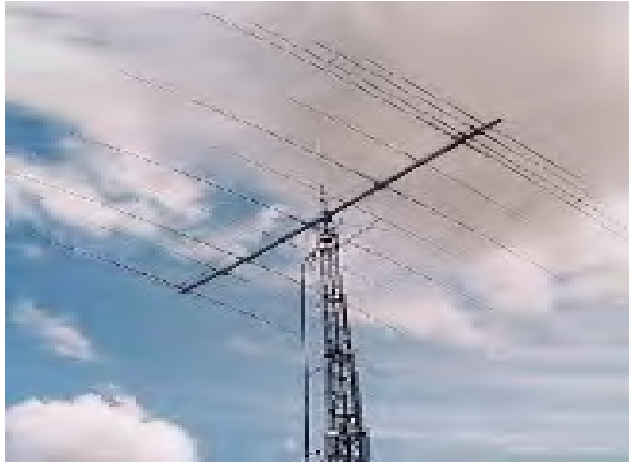
Picture of a 7-band Log-Periodic, with a 10 dBd forward gain on 20 Meters